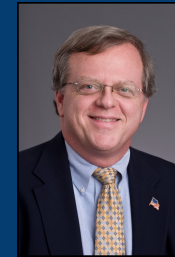
Paul Bettencourt State Senator