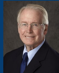
Billy Hamilton Tax Notes