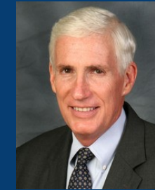
Scott Brister Former Texas Supreme Court Justice